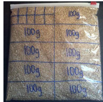
Decompose 100 g into 10 groups of 10 g.