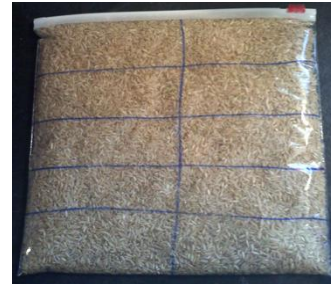
Decompose 1 kg into 10 groups of 100 g.